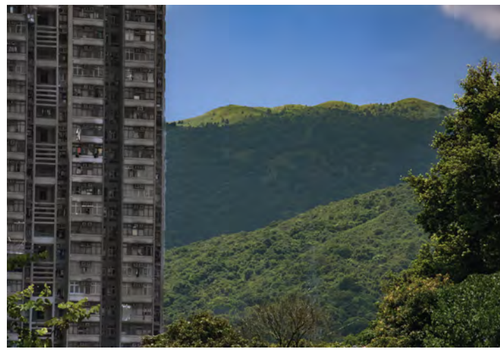
"The Forest Retreats, For Now...," the winning photo in the 2016 Cities/Urbanization student photo contest

"This year, as well as adding to the Council's collection of worksheets on contemporary foreign policy issues and creating a new film review (with discussion questions) of Malcolm X, we dove into our archives and uncovered primary resources from 20th century world and American history," said Shanbaum. "With these fascinating materials that go back to the Council's founding in 1914, I believe we have carved out a niche focusing on history-related education materials, which