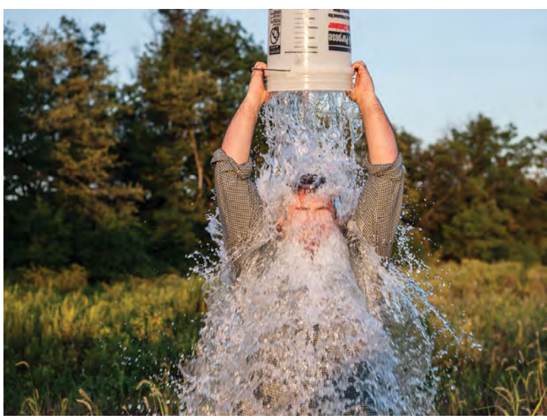
"Mission Accomplished—ALS Ice Bucket Challenge"

This was the eighth year of Global Ethics Forum, Carnegie Council's weekly half-hour television show. The program features a selection of some of the Council's most memorable talks and interviews-always a difficult choice—that work well in edited form for television. Global Ethics Forum airs on over thirty public and university television stations across the United States. The entire series can also be viewed on the Carnegie Council website and on our YouTube page, youtube.com/