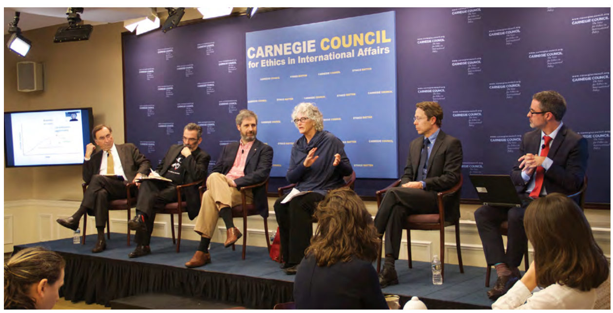
Launch of C2G2, February 2017