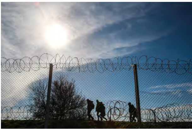
Top: Toronto Refugee Collective; above: Refugees