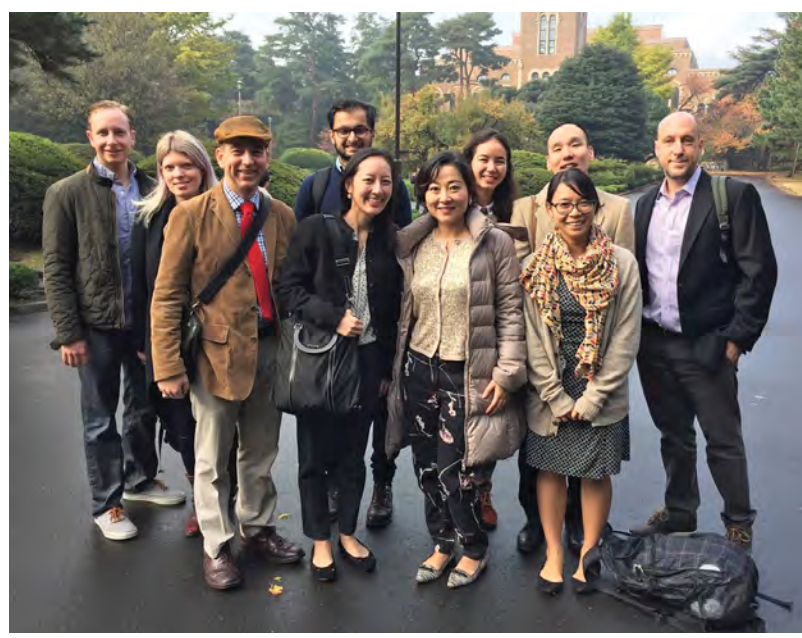
Pacific Delegates in Tokyo

The program has appointed a group of Pacific Fellows based in Japan, Indonesia, and the Philippines, the locations of the first three research trips. Pacific Fellows are responsible for organizing dialogues in their local communities and collaborating with other fellows, students, and Council staff to develop joint research, site visits, publications, and multimedia projects. Each year, the program will appoint a new group of Pacific Delegates from Asia and the United States to take part in the annual research trip. Delegates are chosen from a variety of professional, regional, and academic backgrounds. Before their visit, which takes place in the fall, delegates are provided with a summer online curriculum consisting of reading materials and discussion questions. These curricula are available to all on the Council's website.