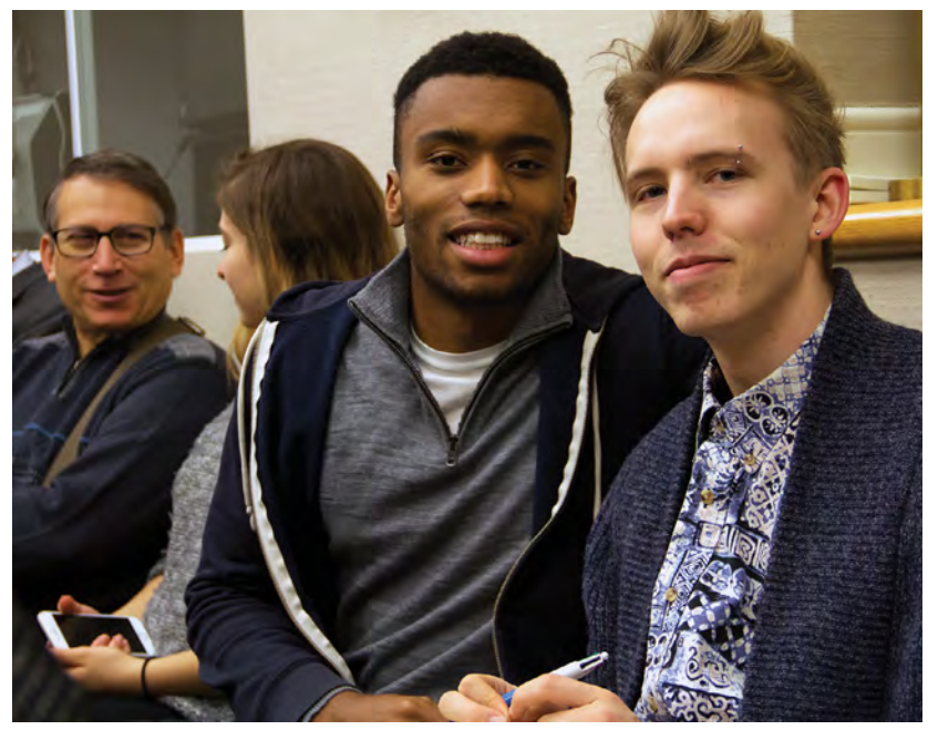
Audience members at "Women's Rights are Human Rights" Ethics Matter event