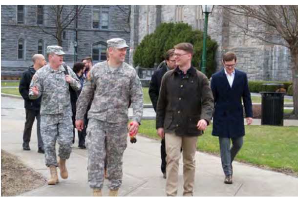
CNL members at West Point for a workshop on ethics and war