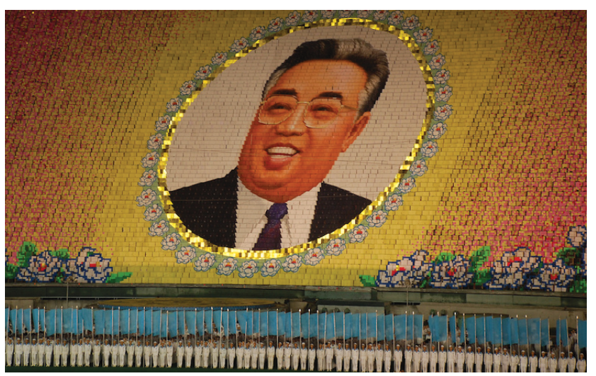
North Korea, Mass Games