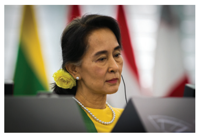
Aung San Suu Kyi