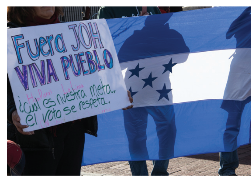
Rally in San Francisco, CA

When Mohammed bin Salman became the crown prince of Saudi Arabia in June 2017, many commentators were optimistic that he would bring sweeping reforms, as he promised. Carter Vance, an MA Candidate at