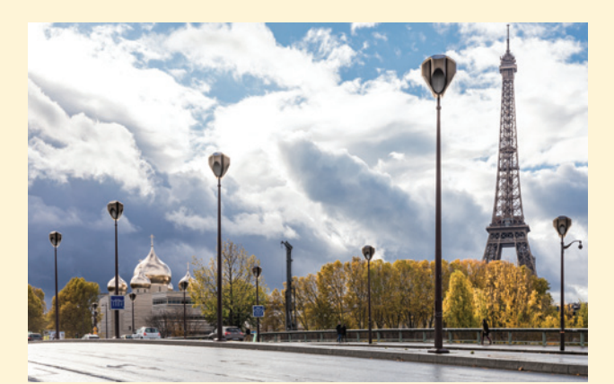
Paris, Russian Orthodox cathedral and Cultural Center in Paris, Quai Branly

Launched in the summer of 2017, the year-long Carnegie Council research project "Russian Soft Power in France" explored Russian influence in French political parties and civil society institutions today. The research includes historical background on relations between France and Russia, which is essential to an understanding of the current situation. This valuable case study on France sheds light on Russia's soft power strategies to bolster allied political parties in established European democracies.