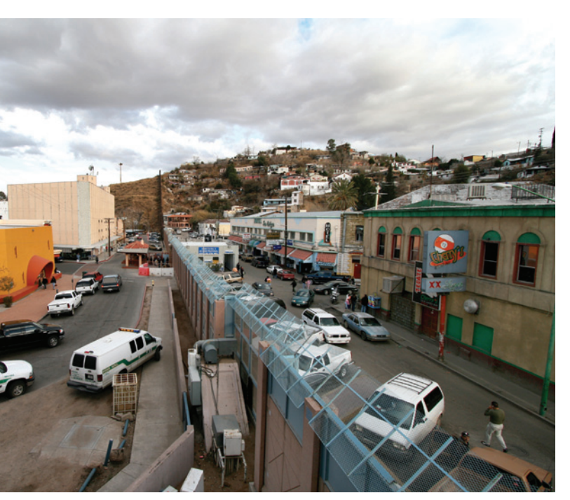
The towns of Nogales, Arizona, left, and Nogales, Mexico, stand separated by a high concrete and steel fence