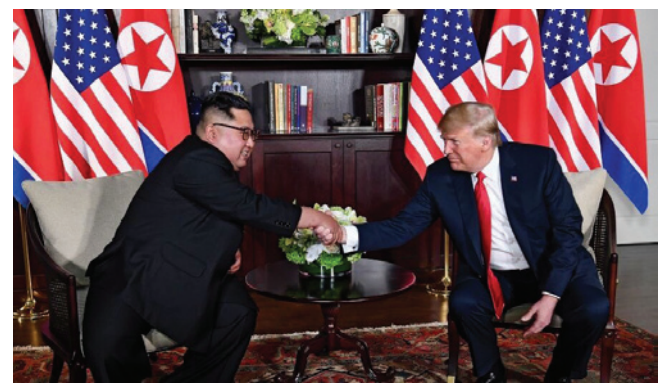
Trump and Kim shaking hands in the summit room during the DPRK-USA Singapore Summit

Finally, over the summer of 2018, Stewart launched a new special interview series titled "Information Warfare," looking at disinformation campaigns and fake news. Find it here: https://www.carnegiecouncil.org/programs/information-warfare.