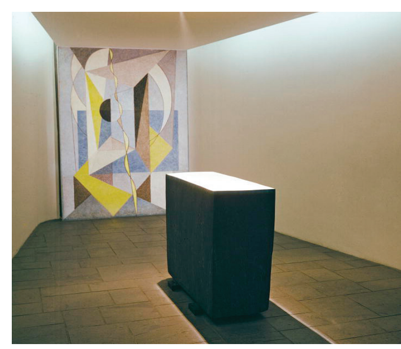
Meditation room at UN Headquarters