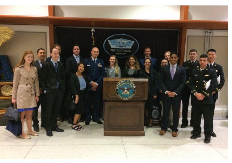
CNLs attend a roundtable at the Pentagon

Site visits this year included an October 2017 visit to the Pentagon in Washington, DC to attend a private roundtable on international security operations at the Pentagon. CNLs also visited Fort Hamilton in Brooklyn where they met with senior Army officers and historians; the U.S. Military Academy at West Point, where they had a roundtable discussion on ethics in the military; and the U.S. Mission to the UN, where they met with a humanitarian advisor for an off-the-record briefing on peacekeeping missions.