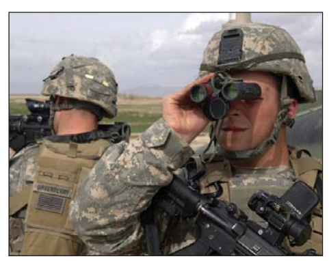
RECONNAISSANCE MISSION IN AFGHANISTAN. WWW.FLICKR.COM