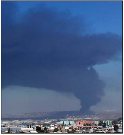
SPREADING SMOKE.

Security Council" (Spring 2011). Concluding that the UN Security Council does not possess exclusive legitimacy when it comes to humanitarian intervention decisions, the authors argued that it is permissible to look for alternative institutional arrangements, and suggested a precommitment regime as a more effective tool for protecting fragile democracies. As they stated: "Under a precommitment regime for democracy protection, a set of democratic states could enter into a contract by which a democratic government would authorize intervention in its own territory in response to violence that the government was unable to control, either due to incapacity or to having been dislodged from power by force."