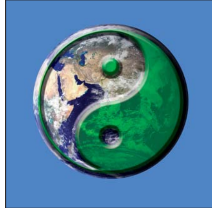
A SUSTAINABLE WORLD. ILLUSTRATION: DENNIS DOYLE